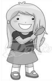
Ana _____ _____

1 What were these people doing at seven o'clock this morning?