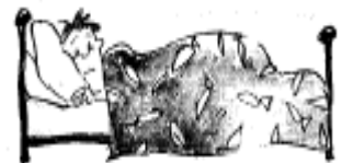
I _____ _____